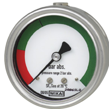
Gas density indicator model GDI-063