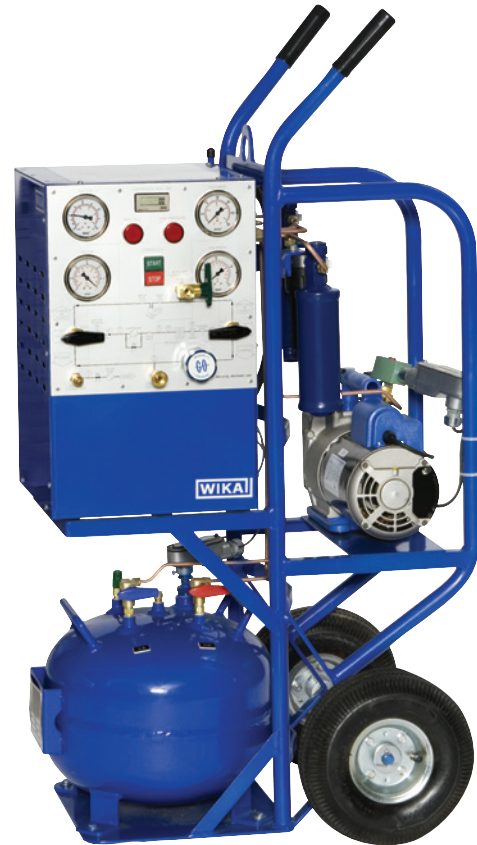
Gas Filling Unit Model GFU10, Compact-Size