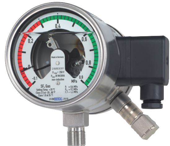
Gas Density Monitor (GDM) with Integrated Gas Density Transmitter, Model 233.52.100 TI

The gas density transmitter picks up the pressure and temperature of the SF 6 -gas contained in the device (tank). The current gas density is ascertained from both variables by means of an electronic evaluation system. Thermal