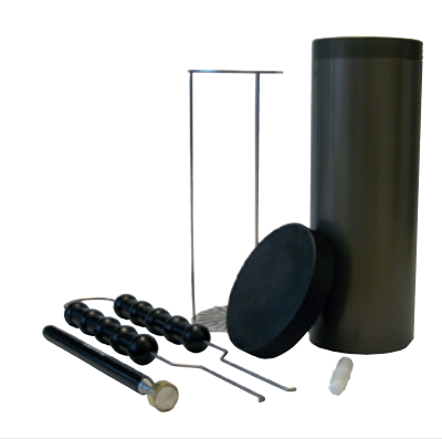
Insert for liquids with accessories

Fig. left: model CTB9100-165 Fig. right: model CTB9100-225